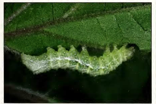
mate instar (La Gomera, Vallehermoso, December mate instar, dorsal view (La Gomera, Vallehermoso, 2011).